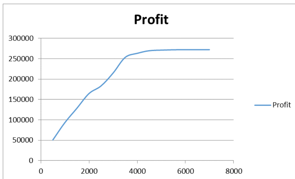
Fig. 1 Investment vs. profit net

In this step we run our model with different scenario on investment. It is clear from the figure 1 below that, after 4000 investing, profit is constant without any changes. Thus, we can run our model.